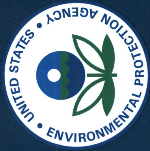
Image from a supplemental slide show to the EPA's water research topic entitled "Pharmaceutical Residues in Municipal Wastewater"