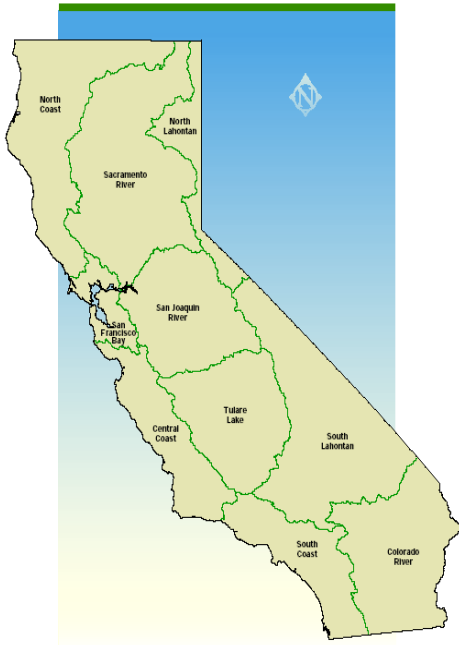
FIGURE 5.2 California's Hydrologic Regions

The California Water Plan Update Bulletin 04-14